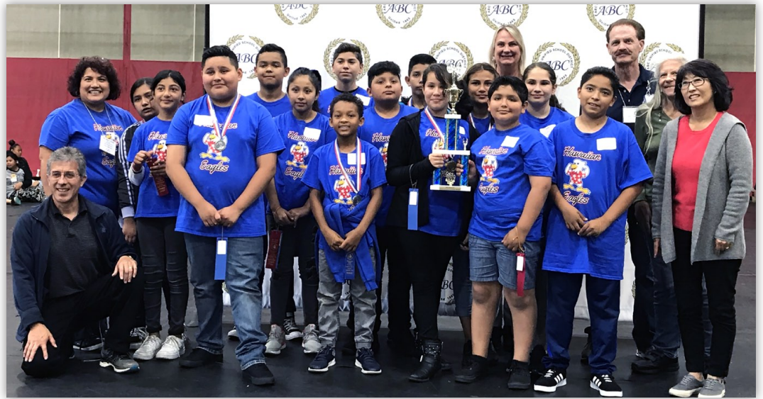
Grand Champion Team Hawaiian ES

ABC Unified School District held its 6 th Annual Elementary STEM Olympics at Artesia HS on Saturday May 11, 2019. Over 200 fifth and sixth grade students representing 17 elementary schools competed in four events testing their engineering skills. The 5 th grade events are Bombs Away and Recycled Racers. In Bombs Away, school teams design parachutes to carry a payload of 8 pennies. They are dropped from 20 feet in the air. The parachute which spends the longest time in the air wins! The Recycled Racers made from recycled materials such as CDs and water bottles are designed by school teams, then raced down a six-foot high, 32-foot long track and the fastest racer wins.