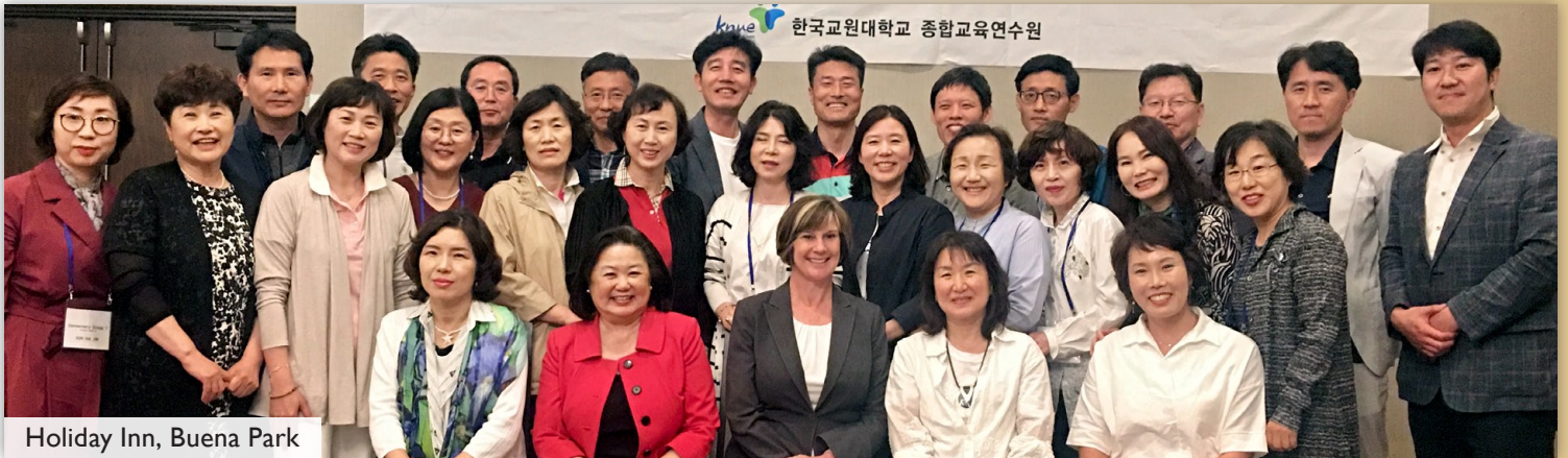
Holiday Inn, Buena Park